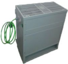
Ethylene Machine GK850 & GK600