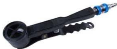
Standard Inflation Tool