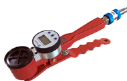
MegaFlow Venturi System